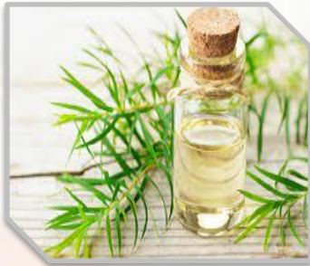
Tea Tree Oil