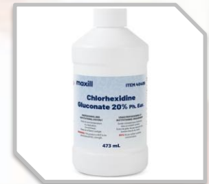
Gluconate Solu. (20 % w/v)